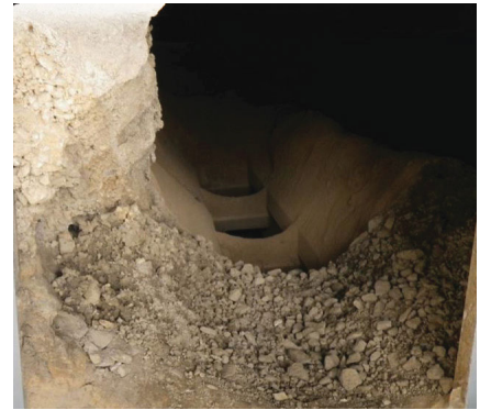
Before: A plugged floor in a screen undersize chute.

Operators in Mining and Mineral processing facilities must deal with people climbing into chutes to unclog material blockage. Confined spaces, lock-out/lock-off protocols and the associated permitting and authorization also makes the need for the correct chute and transfer point lining systems even more important.