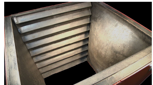
Inflatable Liner Demo Stand

A simple screen underflow chute can be the cause of blockage due to sticky material, just as the discharge chute from a small conveyor can initiate a shutdown due to impact and abrasion damage on a side wall. Bad engineering can also allow large and small material to fall long distances damaging conveyors and chutes alike due to the kinetic energy it develops and expels on the equipment and surrounding walls.