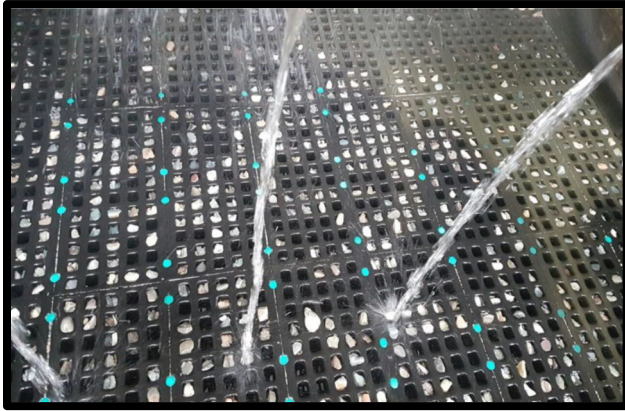
(Photo Above)- Before the screen pegged with particles lodged in the openings.

A Chilean operation had a SAG screening system in place that only lasted 45 days with continuous failures. When pegging occurs, the proper operation, speed, stroke, shaft rotation, and machine balance should be checked to ensure it is optimized for the application. If machine operation has been verified, then a change to the screen surface should be considered. This type of problem requires a specific screening solution.