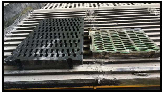
Photo Above (Left) Valley Rubber Screen (Right) Screen used prior to Valley Rubber.