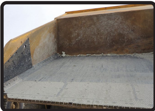
Rubber Truck Bed Liner - Discharge Liners

Ceramic tile will shatter under impact, but when molded into rubber creating a HardLine Liner, it absorbs the shock and prevents the ceramic from breaking, while taking advantage of the wear resistant properties of the tile.