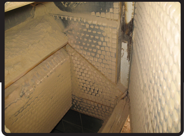
HardCube Liners in this engineered TripleGate Feeder handle the extreme conditions of impact and abrasion for years.

While rubber is more abrasion resistant than steel in the right application, ceramic is more abrasion resistant than rubber. Ceramics alone, without rubber, often are not the right solution.