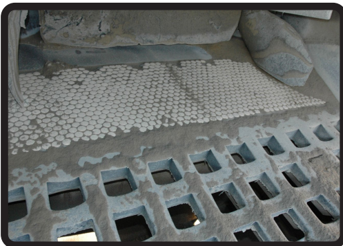
Rubber Scalping Screen - Impact Area

Ceramic balls handle incredible impact because of their shape, but traditional mounting methods do not work. As an alternative, rubber is molded around tightly packed ceramic balls to create Valley Rubber's Hardball Liners for even the most severe impact application.