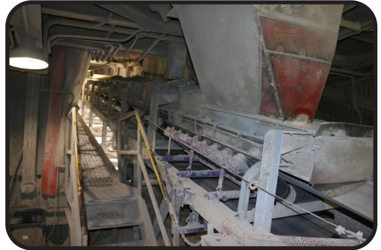
Spillage was a costly issue with this old system.