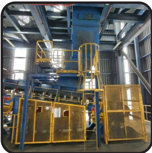
Before Valley Rubber's system was installed