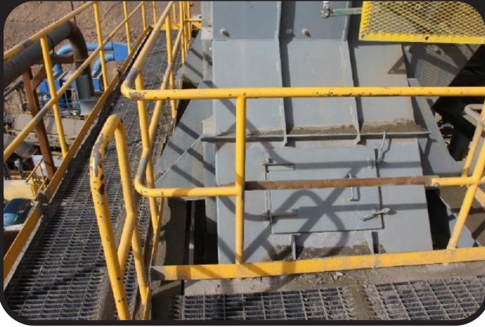
Unsafe access point to the chute