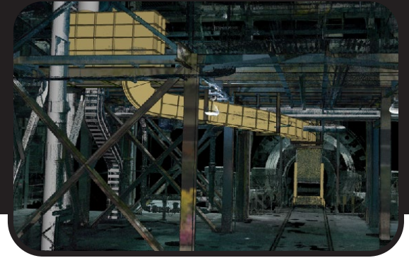
Pre-engineering detail of the Launder System