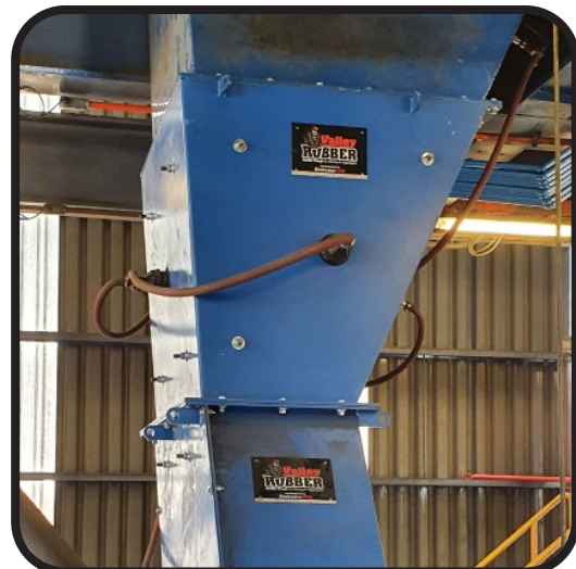
Valley Rubber's new system