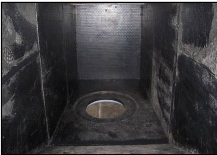
Launder Liners with Rubber-Ceramic held in place with internal magnets – no holes or hardware needed.

Valley Rubber uses the best available technology to bond the ceramic and rubber together. A special coating is applied to the ceramics prior to molding at high temperatures and extreme pressure for an extended time creating a molecular bond between the ceramic and the rubber.