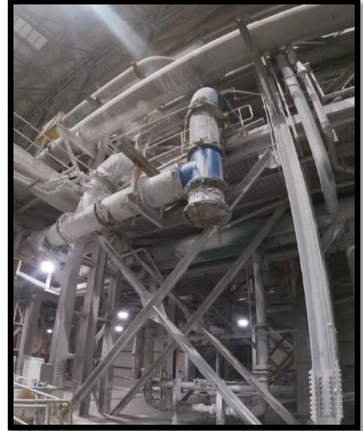
Before: The old system required constant maintenance due to the material buildup in the pipes.

Valley Rubber designed, engineered, manufactured and supervised installation on a system that included a Vertical Chute, an ST Box Reception Chute, and a Launder System that contained magnetic Rubber-Ceramic Liner insets that are projected to outperform the life of the original system by at least eight times.