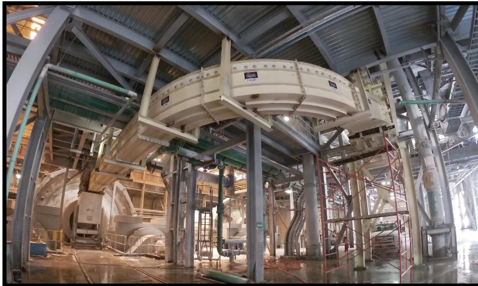
After: Valley Rubber's new system installed.