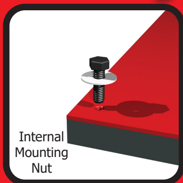
Internal Mounting Nut