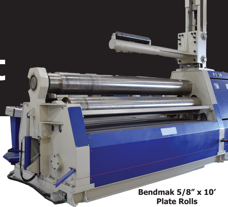
Bendmak 5/8" x 10' Plate Rolls