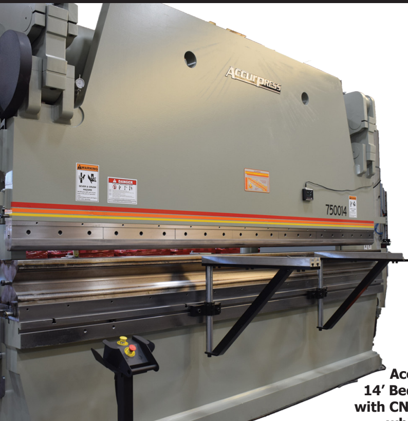
Accurpress 14' Bed x 500 tons with CNC capabilities which allow precise repeatability.