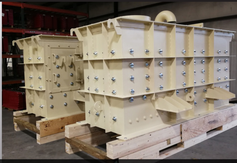
After (Finished Product)