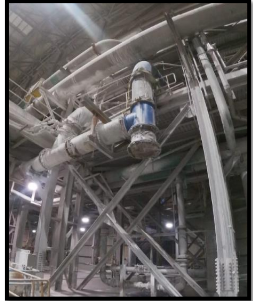
Before: The old system required constant maintenance due to the material buildup in the pipes.

Valley Rubber designed, engineered, manufactured and supervised installation on a system that included a Vertical Chute, an ST Box Reception Chute, and a Launder System that contained magnetic Rubber-Ceramic Liner insets that are projected to outperform the life of the original system by at least eight times.