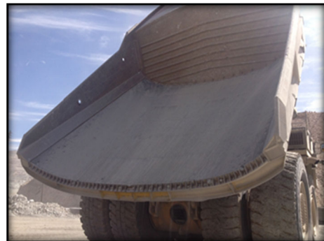
Komatsu 930 Haul Truck, five years of using rubber liners and still in service.